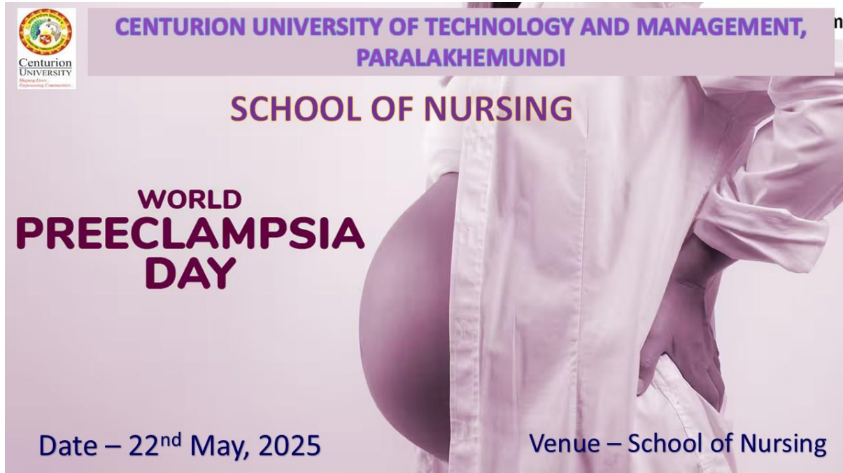
Banner for the event: World Preeclampsia Day at CUTM Paralakhemundi